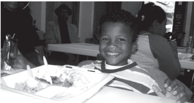
Opening day at our new Kids Café location. Volunteers at Morningstar Baptist Church are now serving the children at Mon View Heights Apts.

You can also help by volunteering, holding a food drive, or collecting non-food essentials.