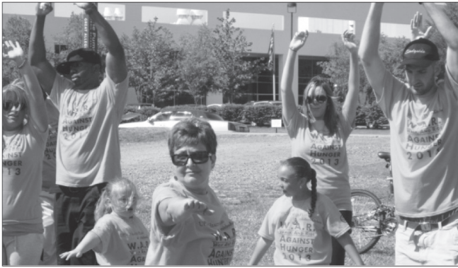
Walkers & riders warm up with a yoga stretch led by BYS Yoga