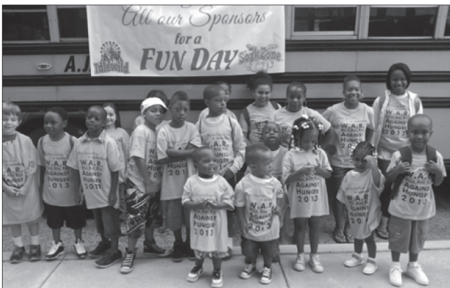
Children boarding the bus for the trip to Idlewild Park