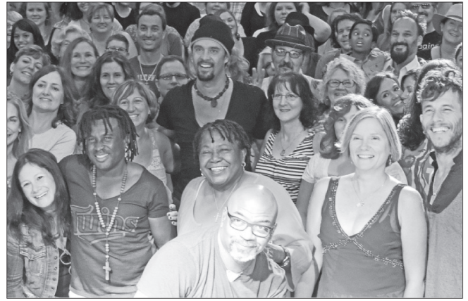
Michael Franti (center, in black cap) asked his fans to bring non-perishable food items to donate to Rainbow Kitchen, when he performed at Carnegie Library Music Hall in September. Look at all those beautiful smiles!