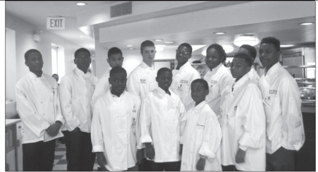
Looking Sharp! #2: The Neighborhood Academy Basketball Team are ready to serve (jackets courtesy of Uniforms Unlimited)